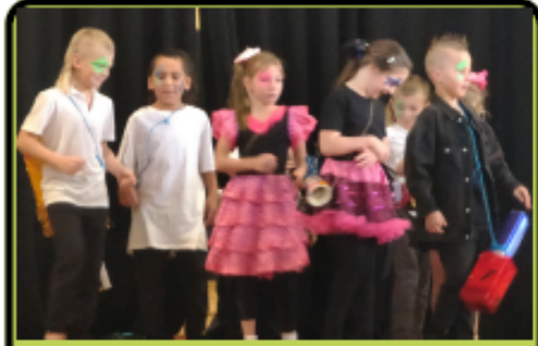
Music Fest 2023

Call into the school office for more information