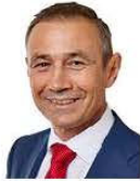
Hon. Roger Cook MLA Premier