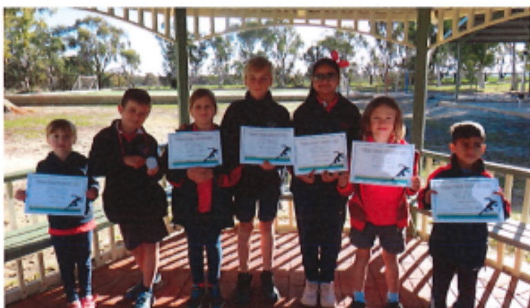
VPSSA Cross Country