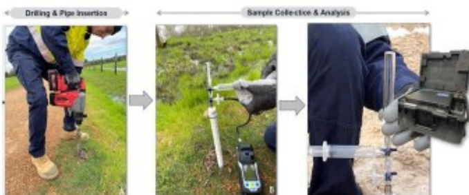
2H Resources Soil Gas Sampling methodology & gas analysis equipment