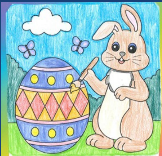
5-7 Year Old Winner