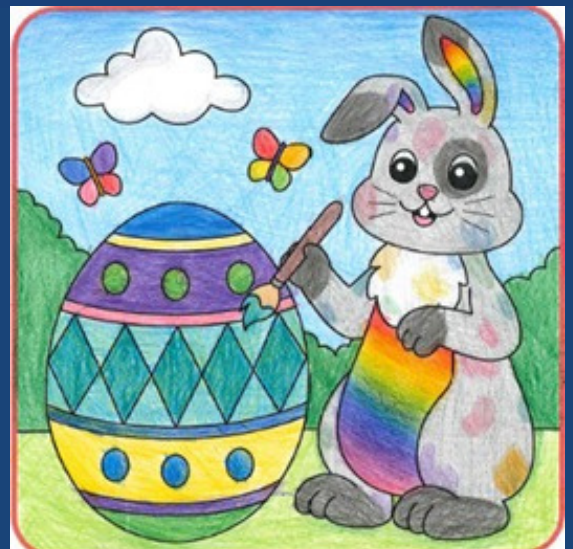
10-12 Year Old Winner