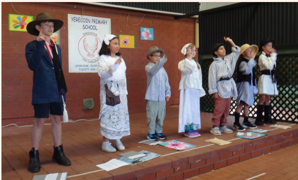
Song: "Botany Bay"