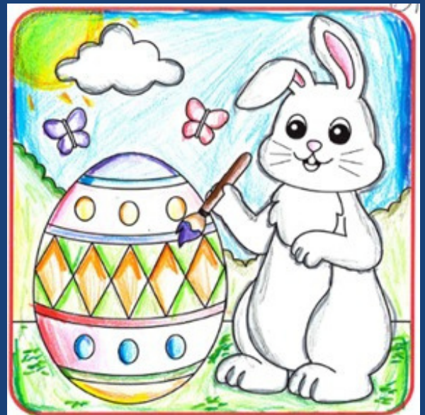
8-9 Year Old Winner