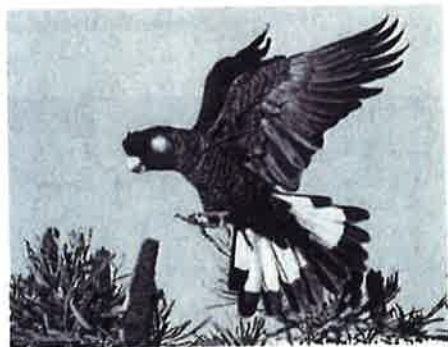
birds are in our nature

Carnaby's are particularly vulnerable to increasing levels of clearing for urban and industrial development across the southwest. It is therefore important we understand the population size and distribution of Carnaby's Black-Cockatoo across their species range.