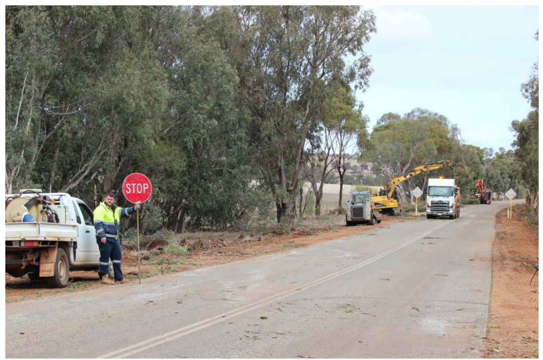
Work on Mogumber – Yarawindah Road