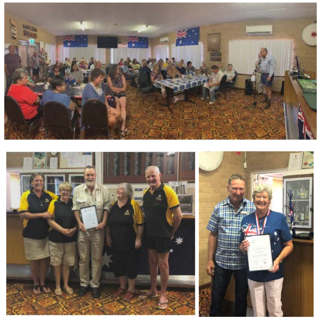
Australia Day Awards 2020