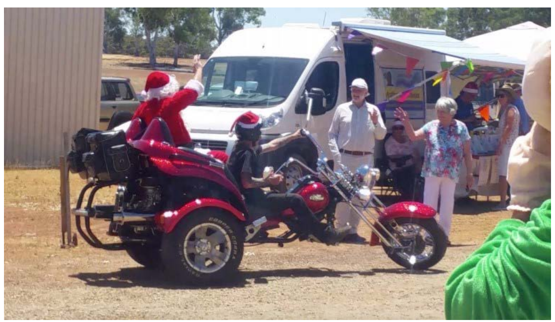
Bolgart Bush Markets!

(e) an overview of the plan for the future of the district made in accordance with section 5.56, including major initiatives that are proposed to commence or to continue in the next financial year.