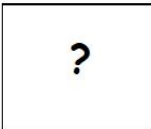
Change the logo, but keep looking for other designs

To cast your vote online scan the QR Code, or go to https://www.surveymonkey.com/r/sovplogo