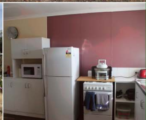
Calingiri 4 Lambert Crescent